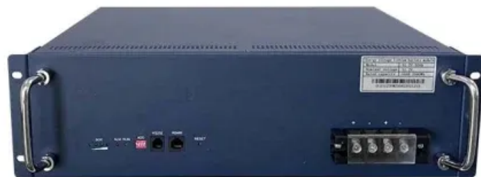
Photo of the special test device for solar container nozzle